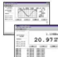
PC Capture of Graphic Display and Data Acquisition. Software Included.

Digital or Graphical displays for viewing, storage or transfer to a PC