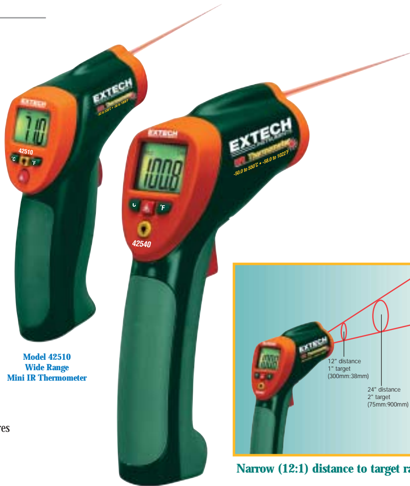
Model 42510 Wide Range Mini IR Thermometer