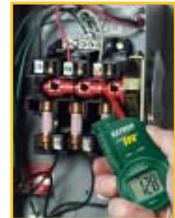
Troubleshooting for hot spots