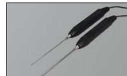
881603 and 881604 immersion probes