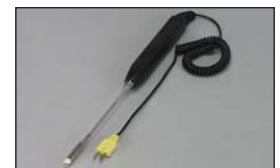
881602 surface probe