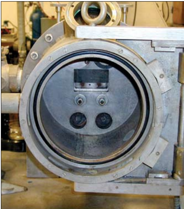
Photo 2. Westerberg Explosion Test Vessel (inside view)

Autoignition temperature limits for group classification of gases and vapors were removed from the NEC . Equipment-operating temperatures, or “T codes,” were established. External temperatures of equipment in these locations cannot exceed autoignition temperature of material.