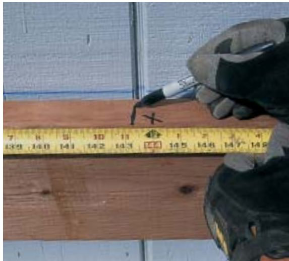
Mark \frac{3}{4} in. to one side of a joist center for the edge of the joist and hanger. Place an "X" to the joist side of the mark to avoid confusion.

Choosing the exact location to begin your layout will depend on such considerations as what