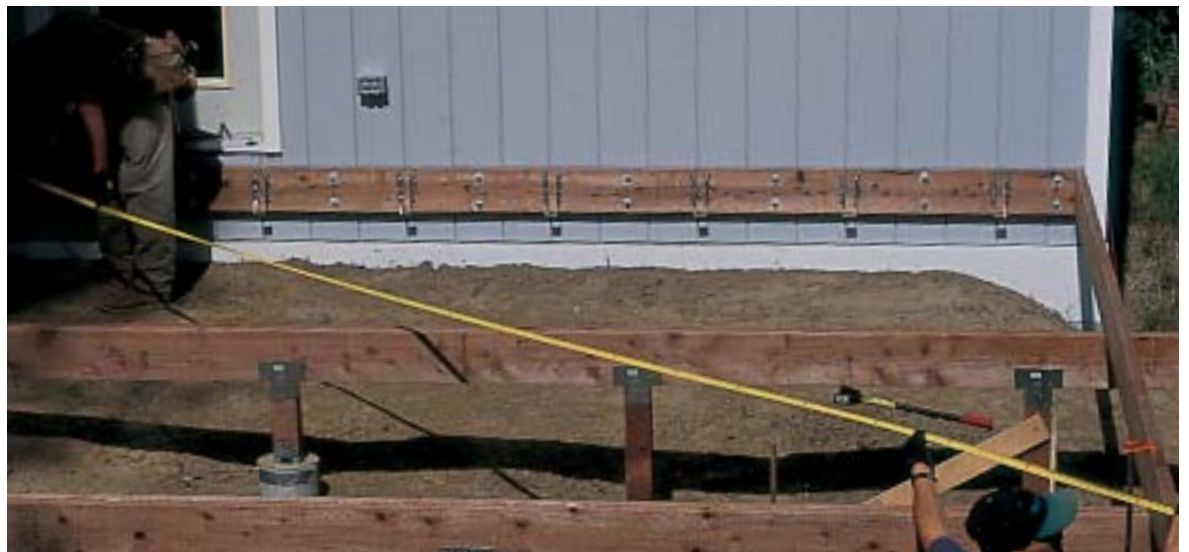
After setting the outside joists, check the diagonals to make sure they are equal.

Once all (or most) of the joists are in place (but not yet fastened to the supporting beam), I can measure their length from the ledger, mark the ends of my two outside joists, and snap a straight chalkline between them to mark the length across the top of the rest of the joists. Then I draw a square cutline on the face of each joist (using the