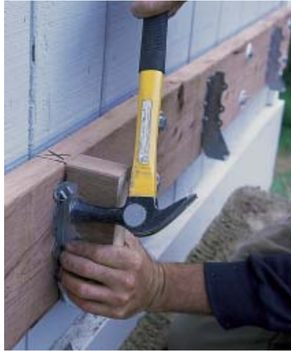
Here a scrap of joist is used to help set the hanger height and keep the side flanges the correct distance apart. Attach the hangers with 1½-in. long galvanized nails made specifically for metal connectors.

Setting the first joist accurately is important because it can serve as a reference for joist layout, particularly when joists are cantilevered over a supporting beam. One way to make sure that the joist is square to the ledger is to align it parallel to the layout string (set during foundation layout; see pp. 34–35) that runs parallel to the house and out to a batter board. Another method I use to square the joist up with the ledger is to use a big, commercially available aluminum square. After setting