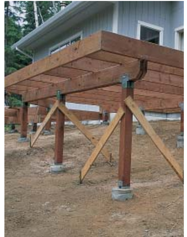
Deck joists are installed and ready for finishing framing details such as blocking and bracing.

Spacing joists closer will increase their span, because the load will be spread over more joists. If you are close to the maximum span, you will have