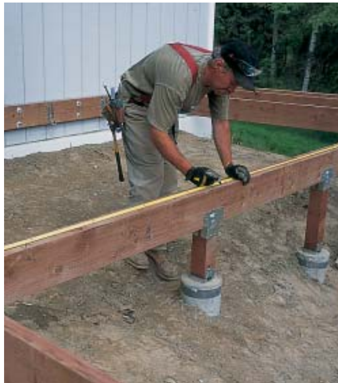
Lay out joist locations on the beam, starting at a point analogous with the ledger starting point so layout marks will correspond.