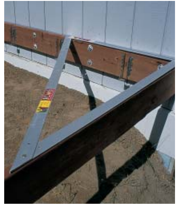
Checking for a square corner between the first joist and ledger is simplified when using this commercially available, folding aluminum square.

the first end joist with a string or a square, I set the opposite side parallel to the first by measuring out along both the beam and the ledger. To quickly double-check that everything is square, I measure the diagonals from corner to corner to make sure they are the same. If they are not, then I adjust the joist before laying out the rest.