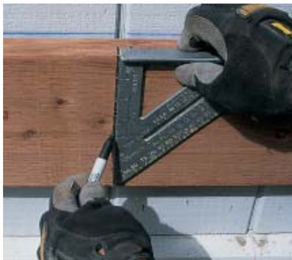
From the layout mark, use a square to draw a line across the ledger face to help align the joist hanger.