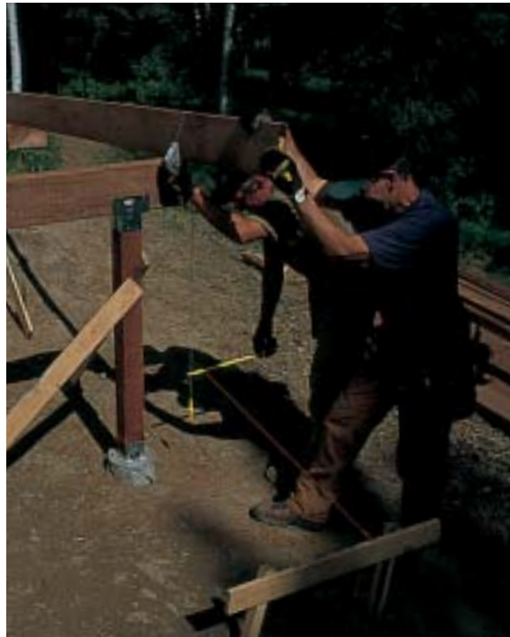
Set the first joist square to the ledger, using a foundation layout string for reference.

If you're installing your decking at a 45-degree angle, the decking will be spanning more distance than if measured perpendicular to the joists. You will need to space the joists closer together to reduce this longer span and meet the table recommendations. A good rule of thumb is to reduce the maximum joist spacing for a particular decking installed on the perpendicular by about one step when laying it on the diagonal. For example, if the recommended spacing is 24 in. o.c., reduce it to 16 in. o.c. for diagonal decking (or go from 16 in. o.c. to 12 in. o.c.)