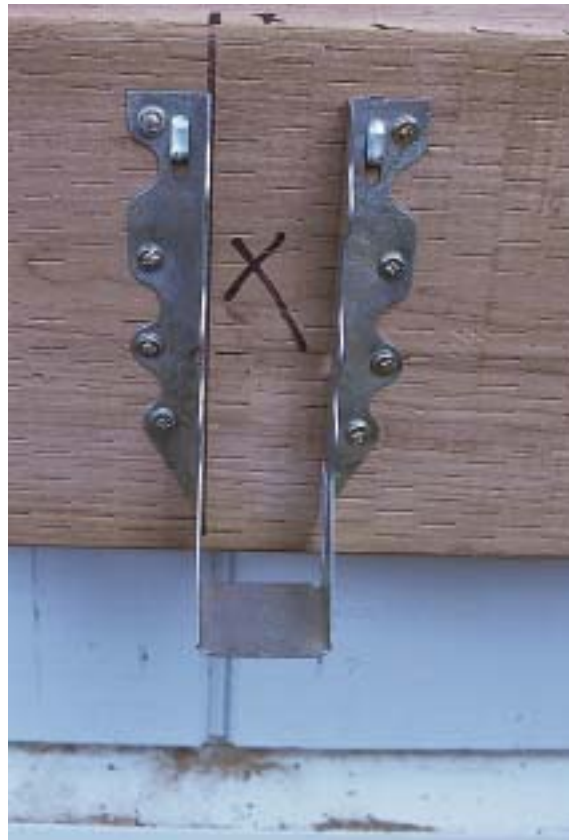
Hanger installed and ready for joist.